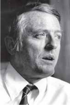
William F. Buckley Jr. 1925-2008

The conservative movement lost its intellectual cornerstone in 2008 with the passing of William F. Buckley Jr. His founding of National Review magazine in 1955 provided the home-base for conservatives in an America seemingly overrun by liberalism. With National Review , and as host of television's Firing Line for 33 years, Buckley spread the cause, helped rally conservatives during the Cold War, was instrumental in helping Ronald Reagan win the presidency — twice — and continued to provide the intellectual ammunition, along with grace and